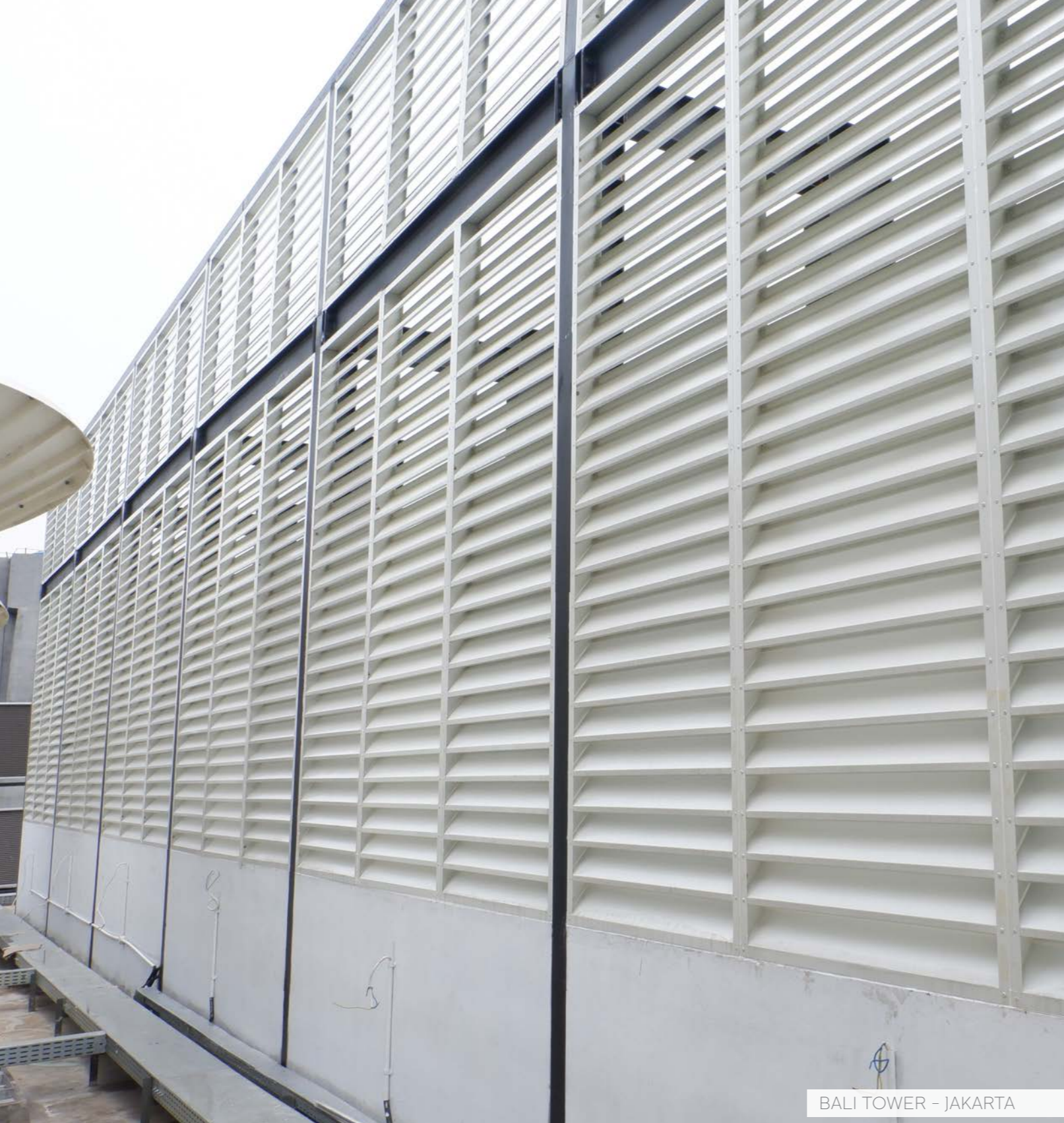
BALI TOWER - JAKARTA