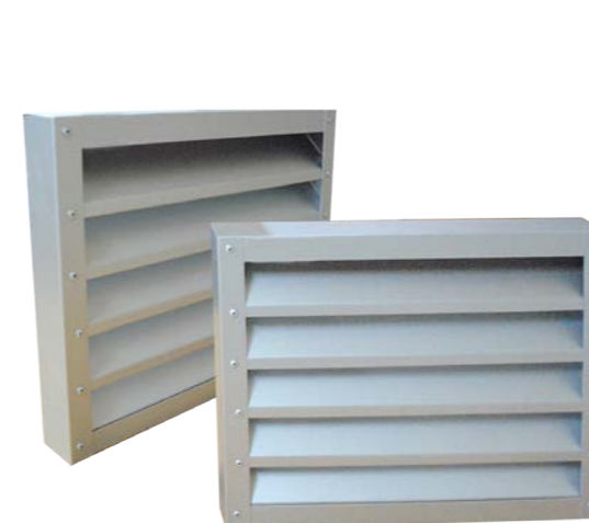
JALOUSIE SMALL TYPE