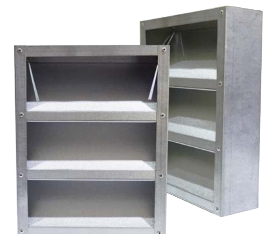
JALOUSIE LARGE TYPE